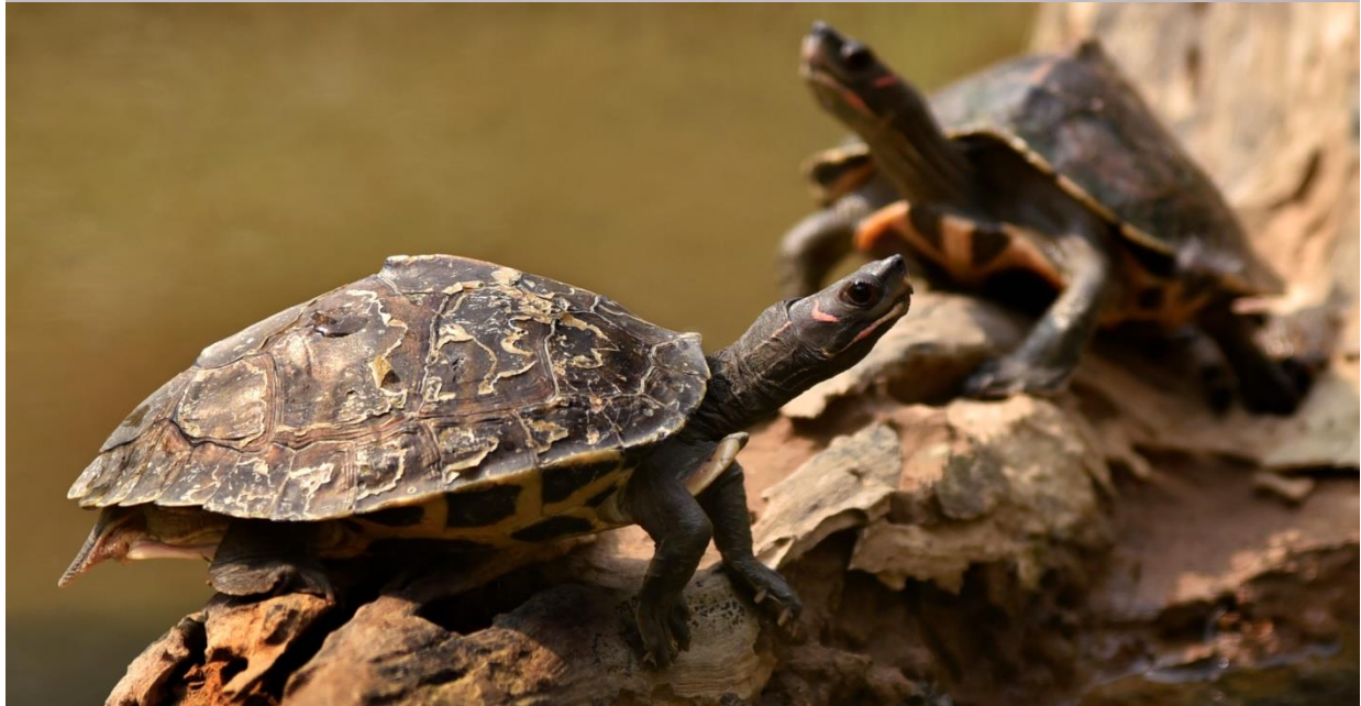
Reptiles – Assam Roofed Turtle, Monitor Lizard, Gharial, Snakes etc